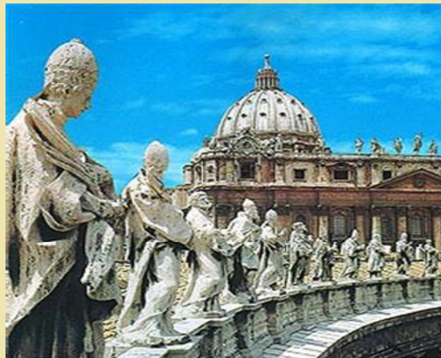
St. Peter's Basilica Bernini's Colonnade

A private driver will be arranged to transfer you to the starting point of your tour. You will walk through the galleries of the Vatican Museums, home to the most celebrated art collection in Europe. You will see Michelangelo's incredible frescoed ceiling in the Sistine Chapel, and be awed by the regal majesty of the Basilica of St. Peter. The tour will end at the Vatican from which you can take a taxi back to the hotel or continue sightseeing on your own.